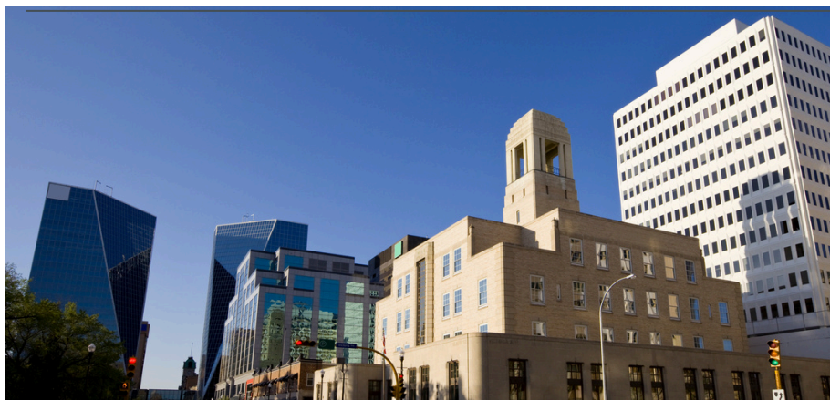
Pictured: Downtown Regina

PTW is excited to announce the opening of our newest branch in Regina, Saskatchewan, marking our 39th location across Canada. This strategic expansion into Regina supports our commitment to strengthening our nationwide presence. The city's diverse economy, driven by industries like energy, mining, and agriculture, makes it an ideal location for growth.